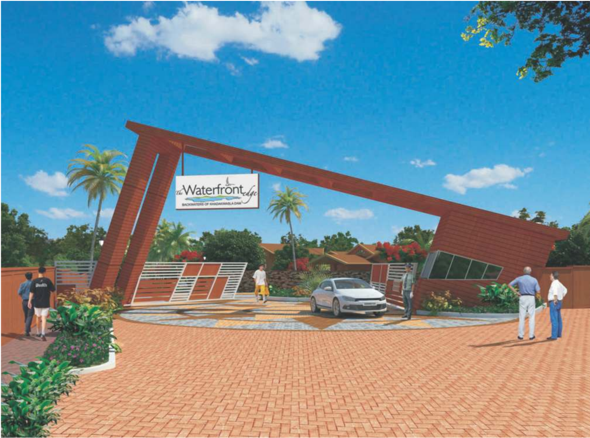
Designer Entrance Gate