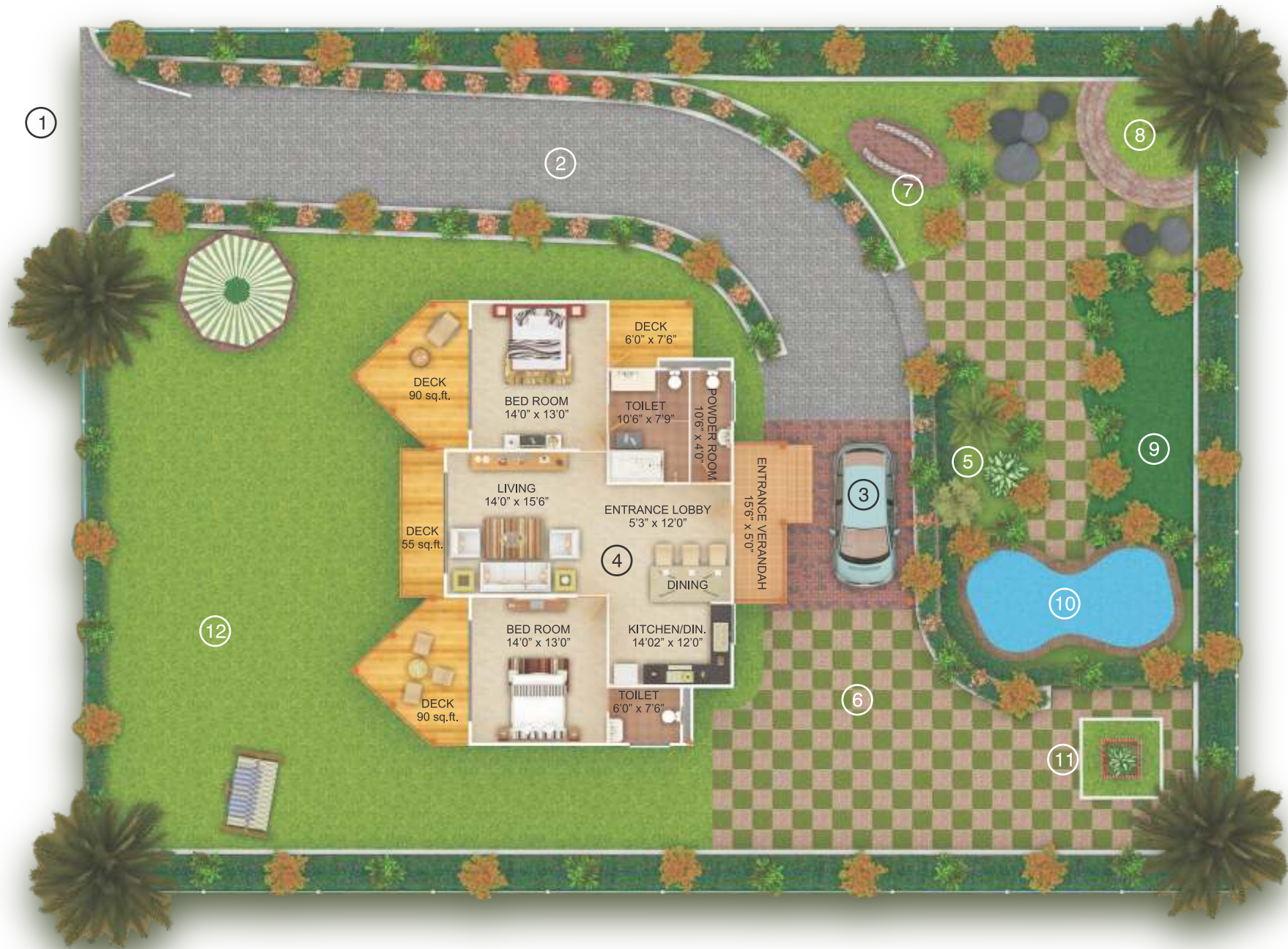
A TYPICAL 2 BHK CHALET