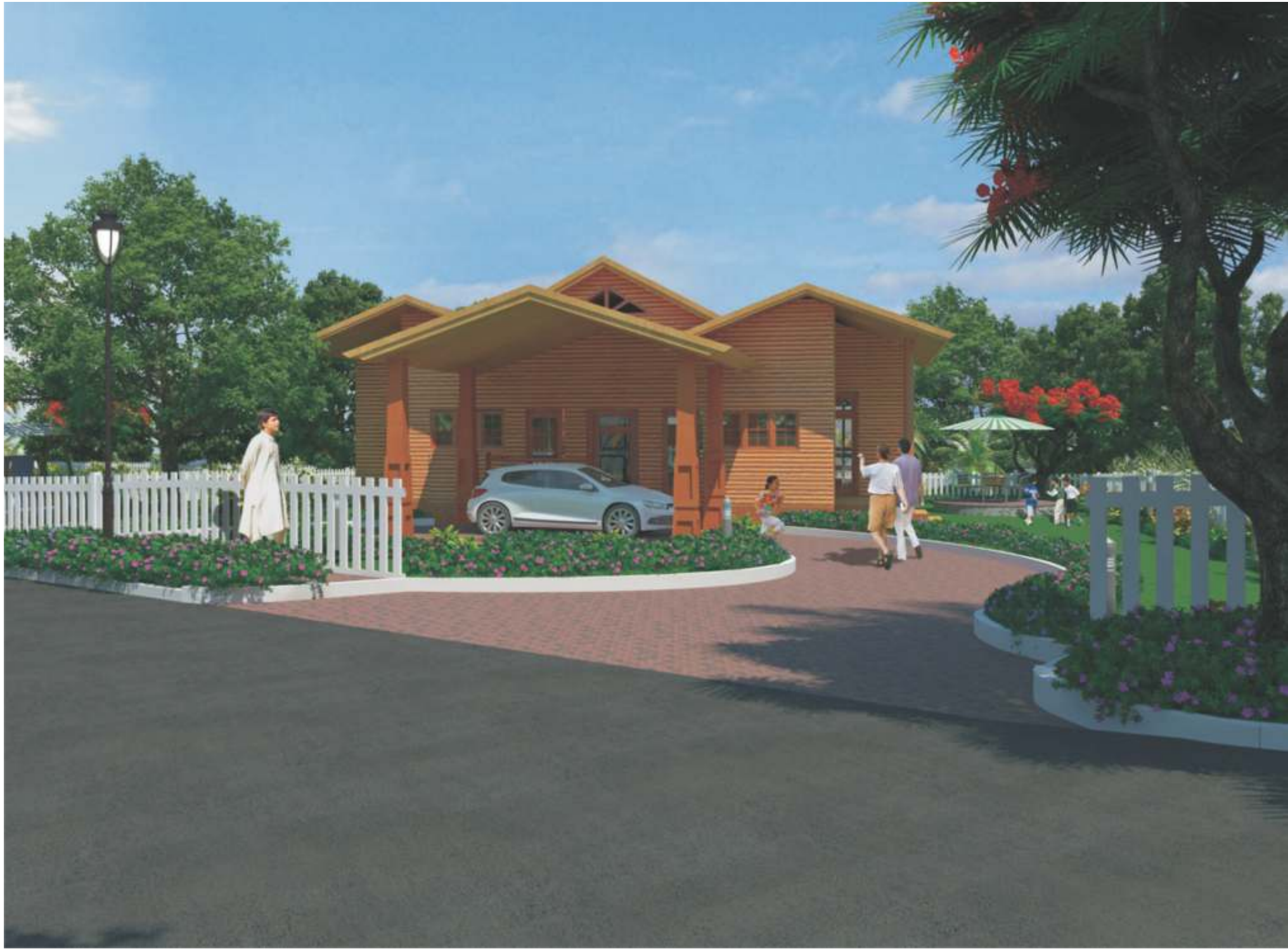
A Typical Chalet

To adorn your scenic farmhouse plot, you can build the home of your dreams. Or, if you opt for it, our architect has designed a picture-perfect Swiss-style chalet that we could construct for you, customized as per your needs.