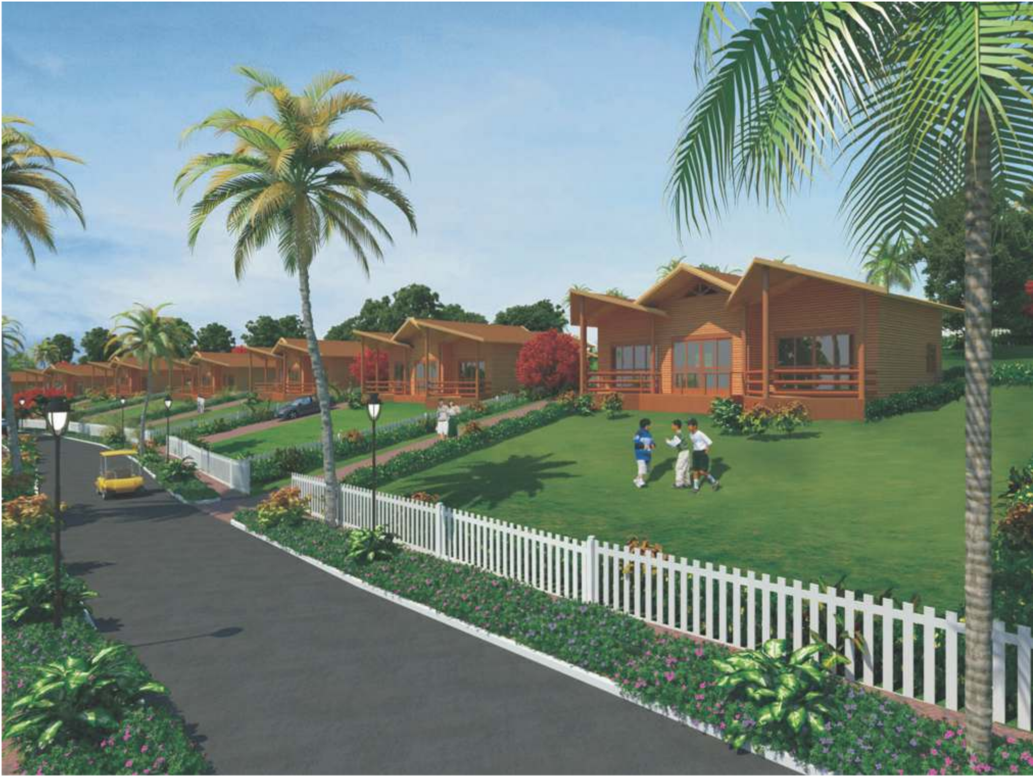
Chalets amidst Natural Surrounding