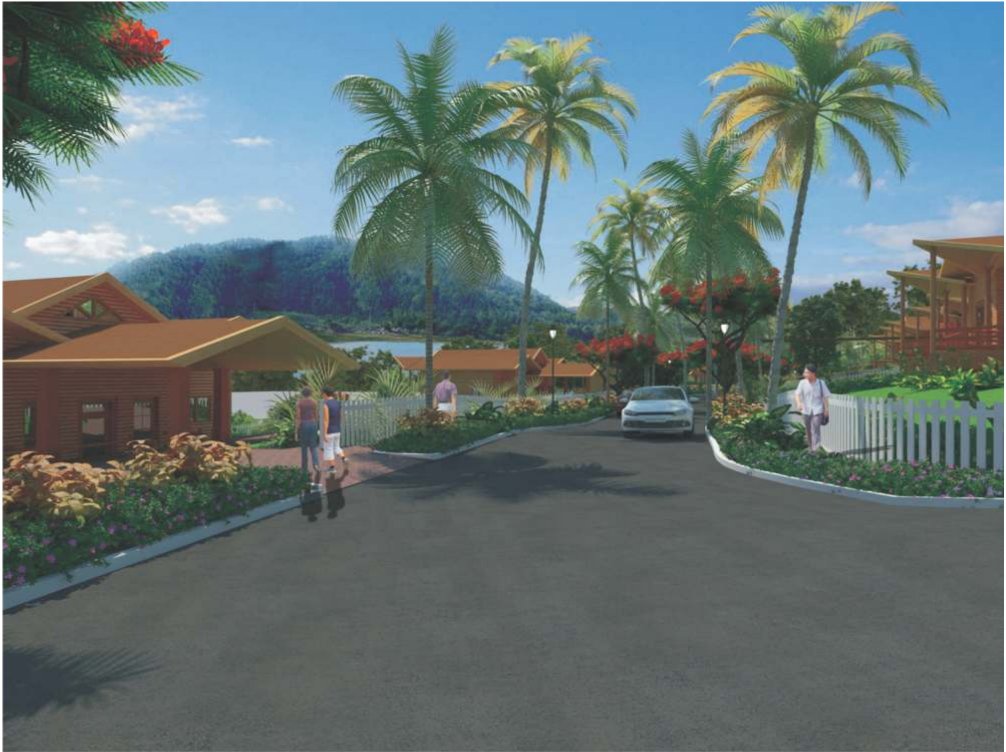
Clutter Free Roads & Walking Plaza

Here a chalet means an "abode" - your own private space to cool your heels, to entertain your spirit coupled with the melody of soul, throwing all yours inner noise far away. The Waterfront Edge is the perfect place to build your dream home or weekend getaway!