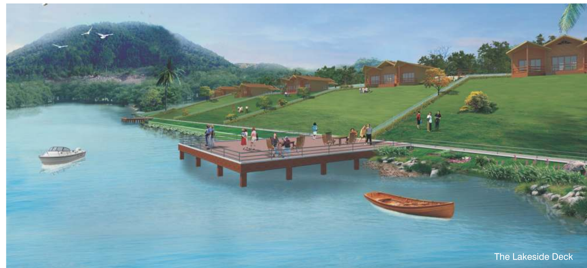
The Lakeside Deck